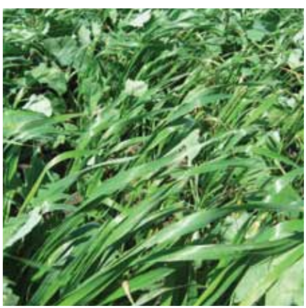
New grower groups starting to collect check-offs for innovative research.

For the most part, Australia's research dol-