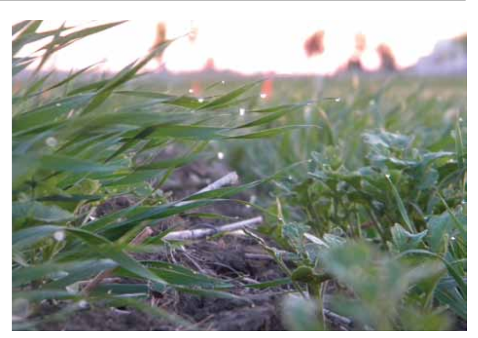
New fertilizer regulations coming down the line next spring.