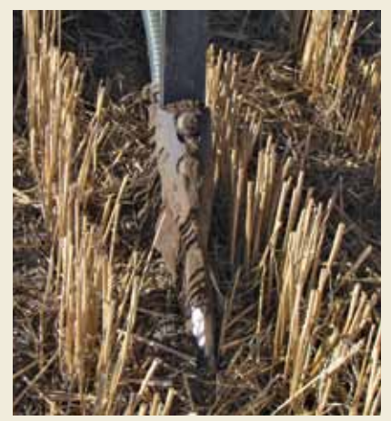
Seeding on top of stubble rows results in reduction in plant stand.

However, we also advise caution, as sometime when we have our eyes too focused on one target, we can completely miss a bigger opportunity.