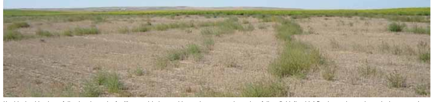
Healthy kochia plants following the path of rolling seed-laden tumbleweeds across a clean chemfallow field. (kochia) Producers learn about glyphosate-resistant kochia at a Farming Smarter field school module.

Blackshaw agrees. Diversity in crop sequences open up more weed control options. "Crop management plays a role in weed management."