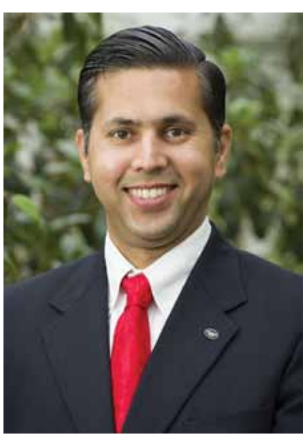
Raj Khosla - the "godfather of precision agriculture."

Precision agriculture in the developed world started with advanced and innovative technologies and now it's even more sophisticated and complex. But, Khosla still sees it as an art as well as a science that uses advanced technologies to enhance the efficiency, productivity and profitability of agriculture production systems in an environmentally friendly way. And, you can get into precision ag without great expense or committing to the steep learning curve some