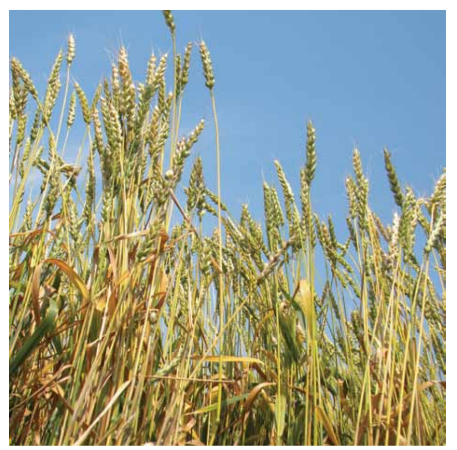
CWB still in the game, with more than 170 locations across Western Canada where farmers can deliver grain

Richardson joins Viterra, Cargill, Louis Dreyfus, Mission Terminal, West Central