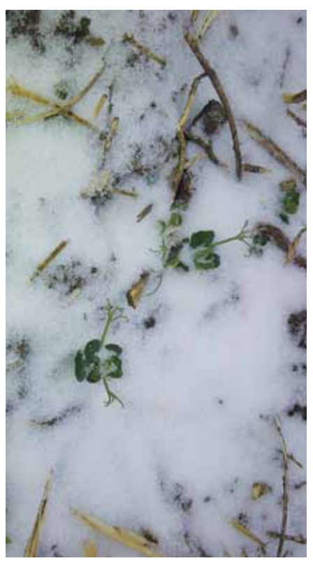
Winter pulses are a great fit for southern Alberta.

Any practice, repeated, sets up an environment where some type of pest can thrive. Indian rice farmers hand weed their crop, recognizing a weedy wild rice by its pink color. Even so, a white-stemmed wild rice that looks just like a rice plant has developed. Alternating two winter crops with two spring