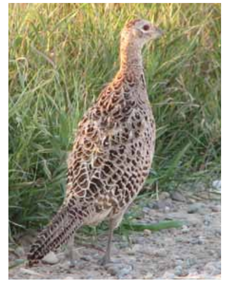
Farming Smarter plans to use results to focus future research and extension efforts towards the issues that are most important to southern Alberta farmers.

"First we want to ensure that producers are