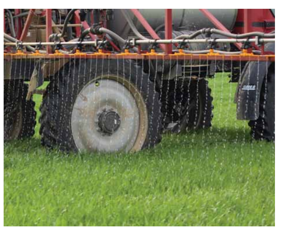
A producer uses a large self-propelled sprayer equipped with stream bars to apply liquid nitrogen. Post applications such as these are targeted to reduce risk and apply nitrogen to feed the yield potential, rather than putting all the nitrogen down at seeding time.

He suggests placing a base amount of nitrogen with the seed to produce an acceptable,