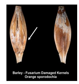
Fusarium graminearum infected barley kernels (right - black sexual fruiting bodies that release wind-borne ascospores. left - orangish masses of rain-splashed spores)