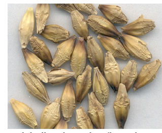
Brownish discolouration (kernel smudge) in barley caused by spot blotch fungus infection