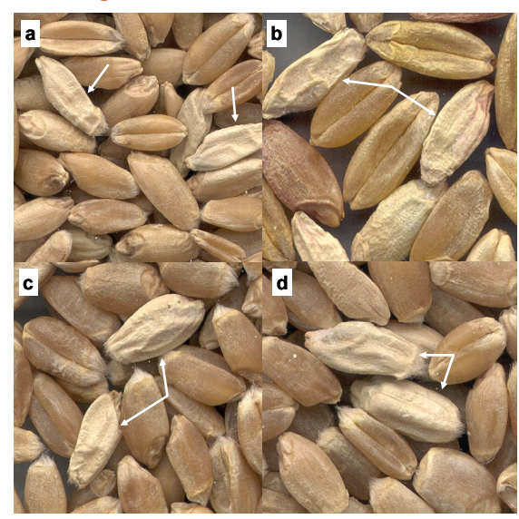
FKD in Canada Prairie Spring (a), Amber Durum (b), and Canadian Western Red Spring (c & d). Currently, FDK's in Alberta are relatively rare and typically caused by species other than F. graminearum. In Manitoba most FDK's are caused by F. graminearum