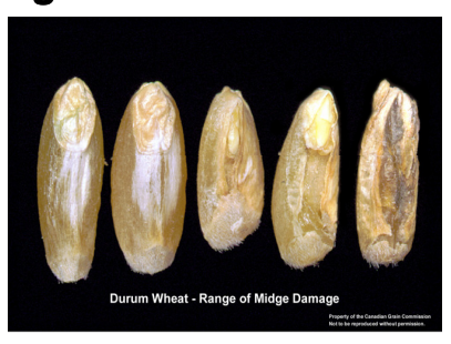
Orange wheat blossom midge damage in wheat