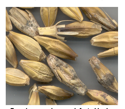
Fusarium graminearum infected barley with 15 ppm deoxynivalenol (DON). Compare with symptoms caused by other diseases