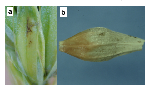
Brownish lesion (a) and orangish discolouration (b) of barley kernels due to the net blotch fungus