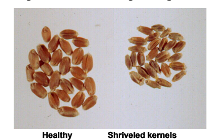
Kernel size reduction in Katepwa wheat due to leaf infection by Septoria leaf spots. Seed infection with Septoria can also produce FDK-like symptoms